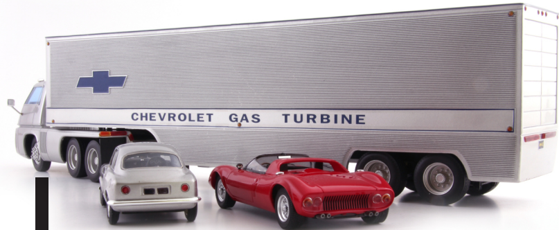
TRUCKS Chevrolet Turbo Titan III (USA, 1966) silver 360 mm (scale 1/43) #11017