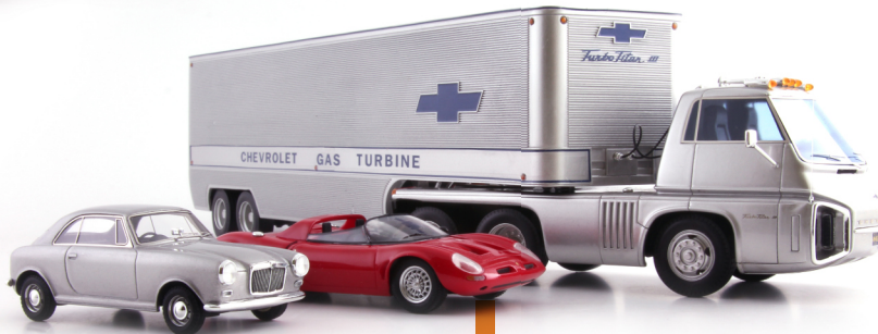
SPECIAL EDITIONS Bizzarrini AMX/3 Spyder (I, 1971) red 95 mm (scale 1/43) #05044